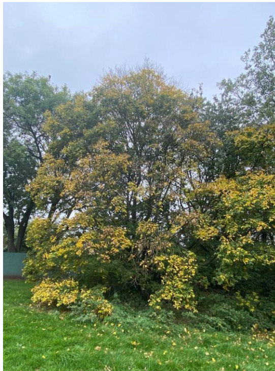
One tree to be crown lifted