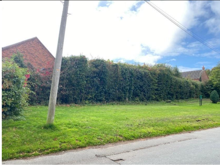
Job done on 8 th October 2025