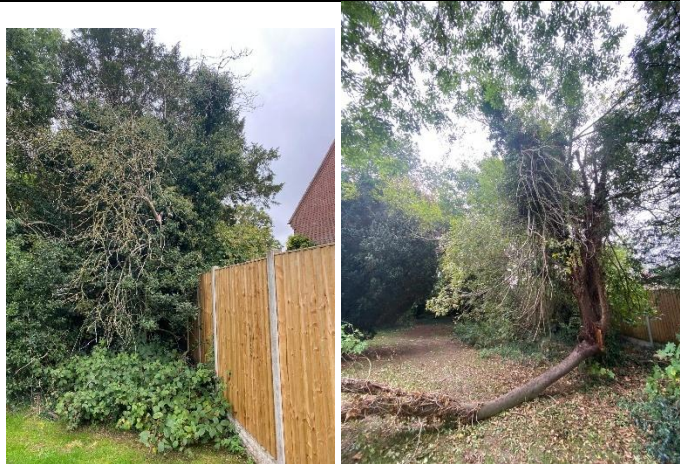
Two dead trees to be felled